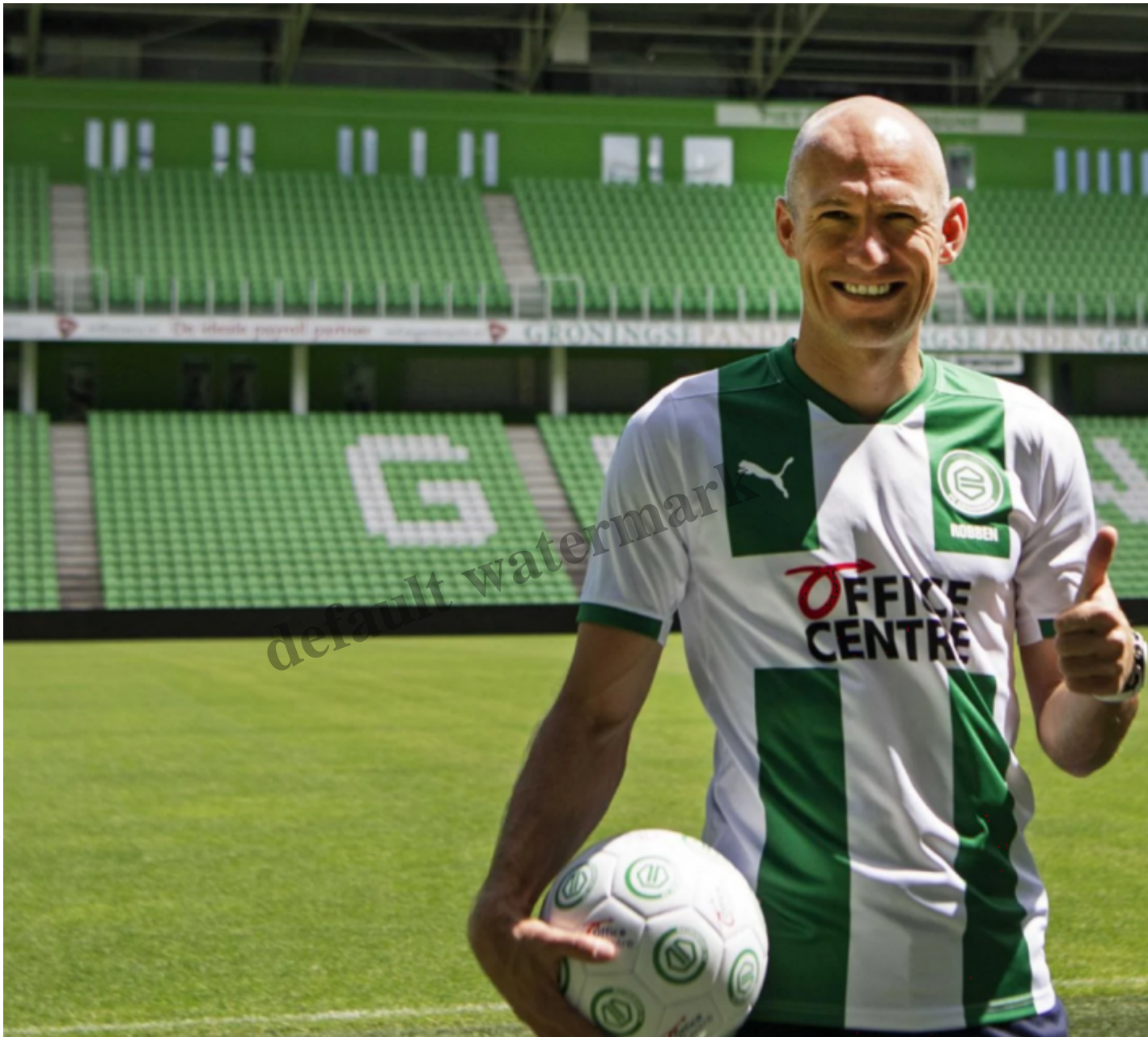
Robben back at his first club

On the 4th of July 2019, Robben decided to retire. However, eleven months later in June 2020 in the wake of Covid-19, Robben returned to football and signed with his first club FC Groningen for one last dance. His return was to help the club with financial setbacks resulting from Covid-19. Although injuries restricted his playing time, the move attracted a lot of attention for Groningen in a period of difficulty. Robben finally hung up his boots in July 2021 after thirteen months in his hometown.