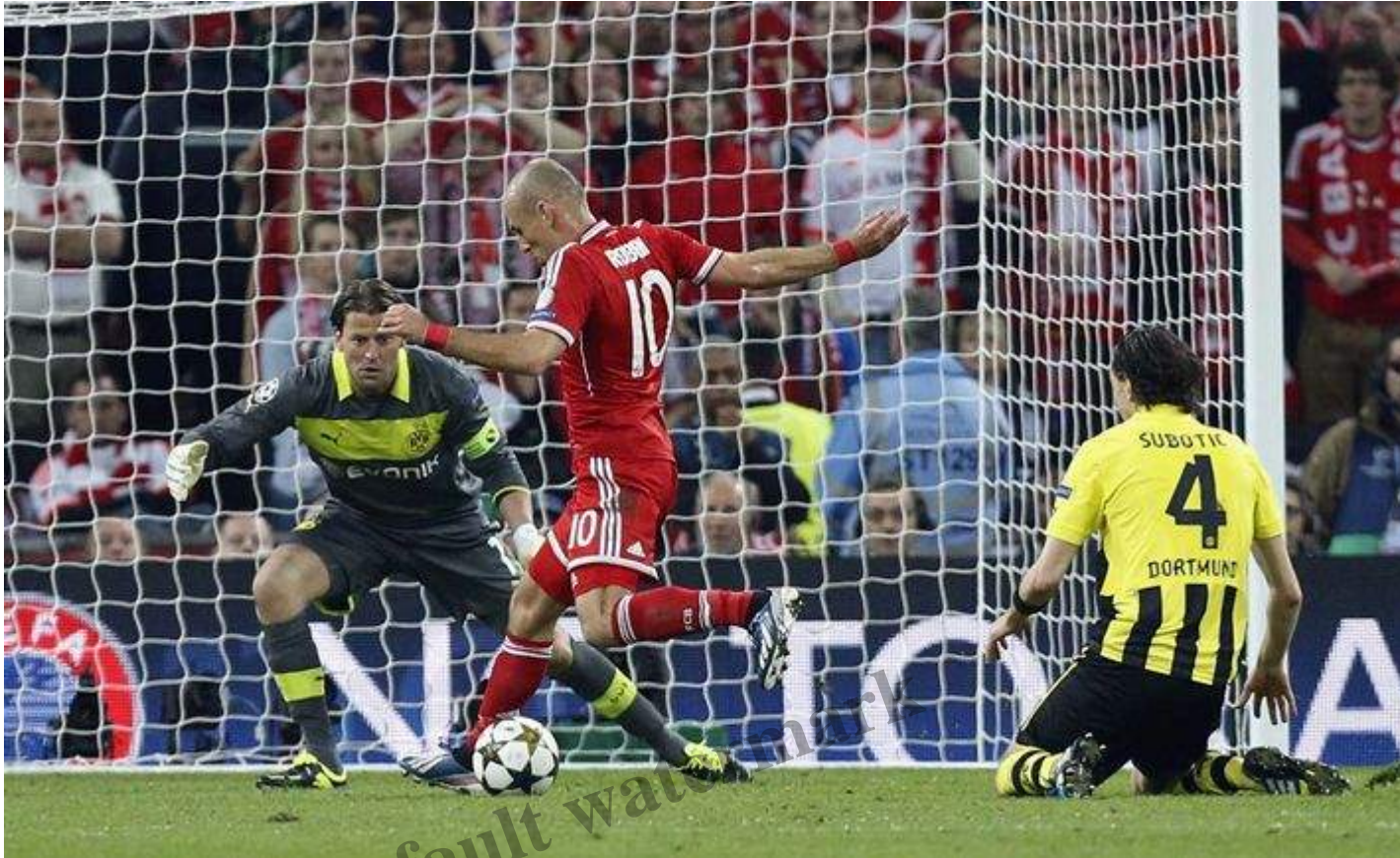
Robben's late goal wins Bayern the Champions League