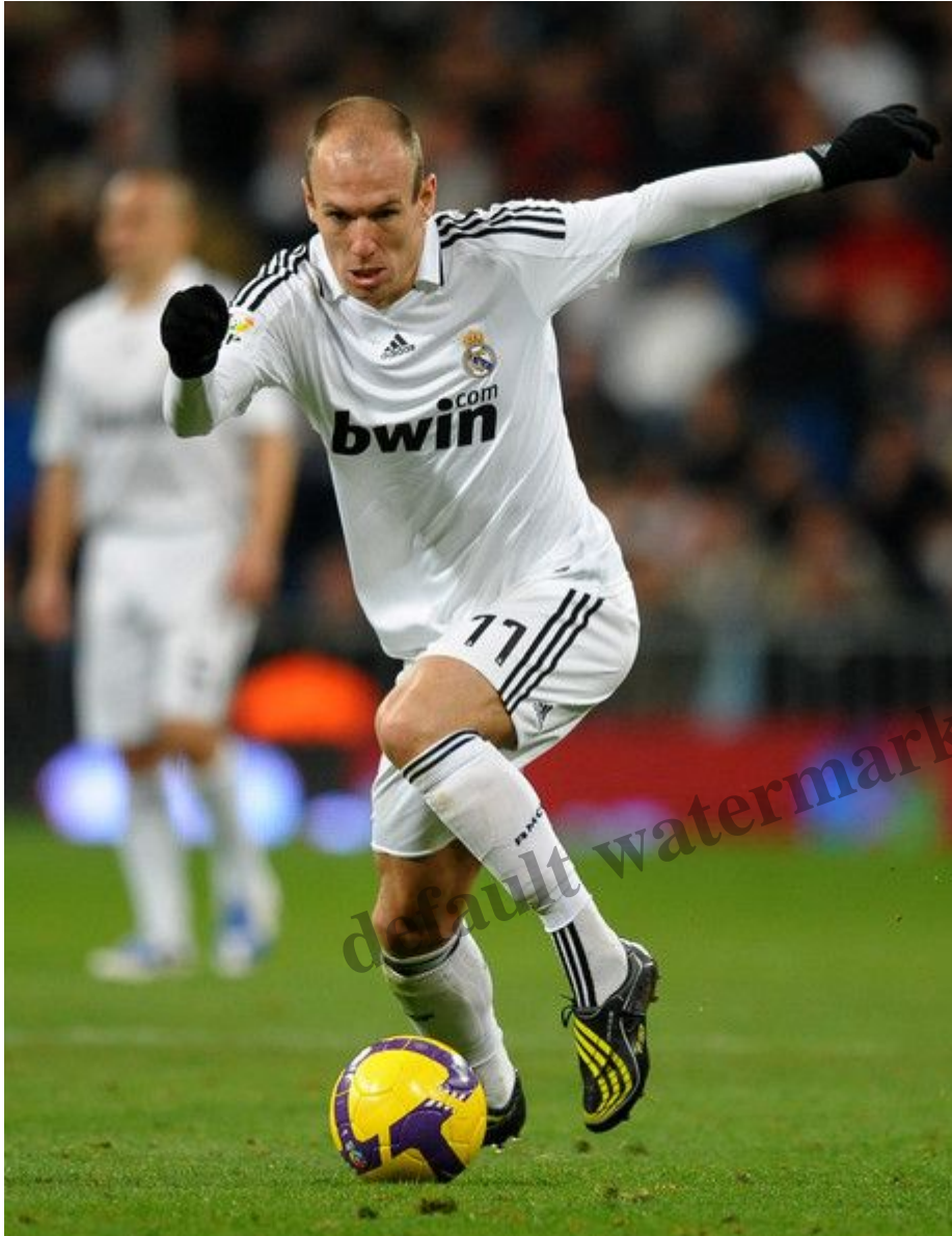
Where the legend was born