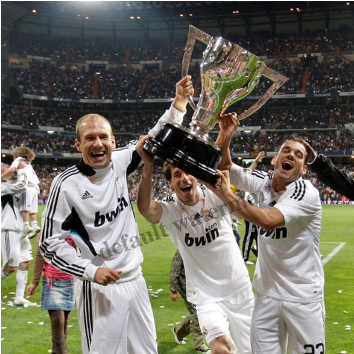
Robben lifting the la Liga title alongside his fellow countrymen Van Nistelrooy and Sneijder

to the top spot for the 07-08 season and won the La Liga title adding to the Dutchman's growing collection.