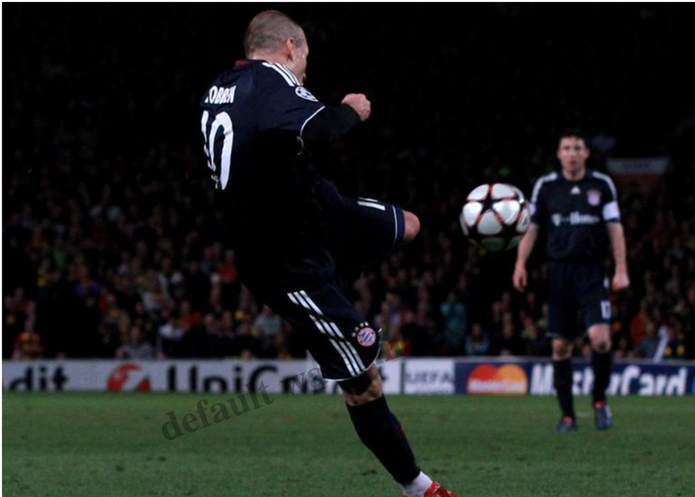
Robben's sweetly timed volley at Old Trafford in 2010

another 4-all draw seeing the Bavarians progress again on away-goals.