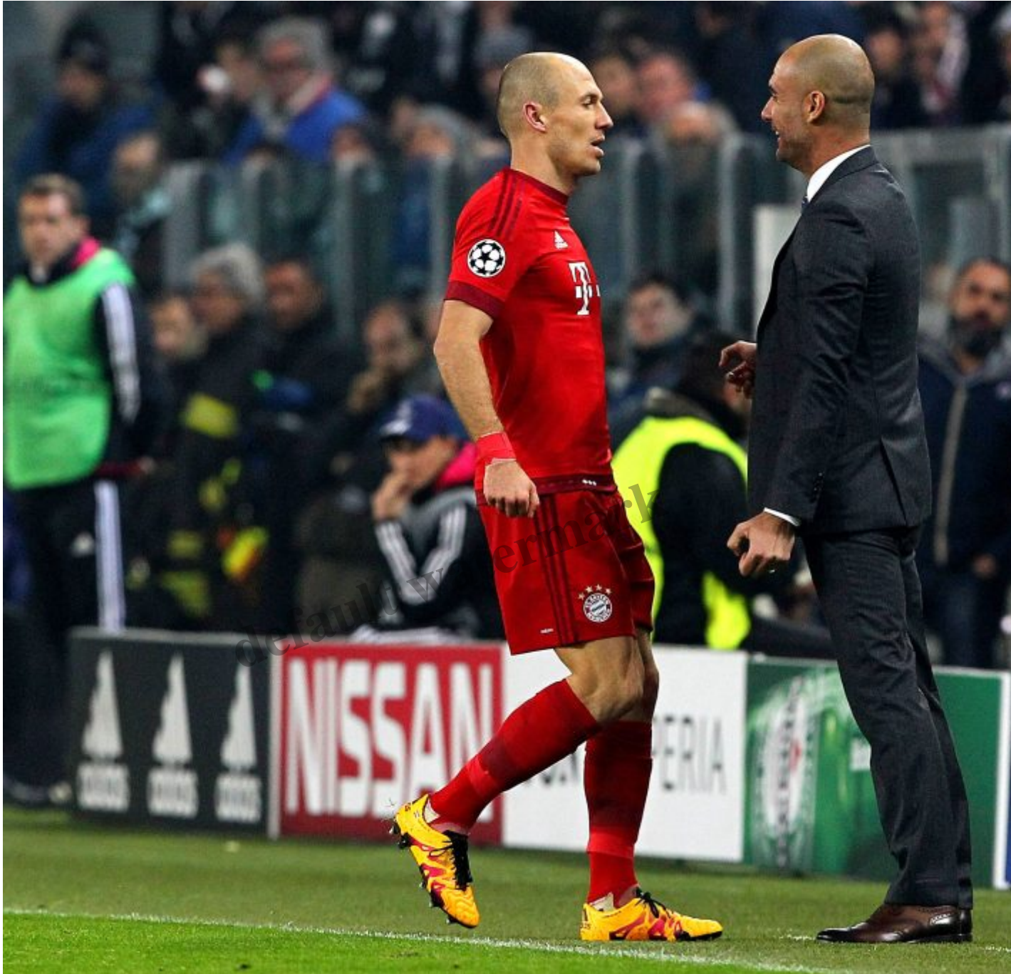
Robben with Pep Guardiola

Robben's final notable major tournament with the Netherlands was the 2014 World Cup. In the team's first match against defending champions Spain, Robben contributed two goals in a stunning 5-1 victory. He then helped the team make the semi-finals by earning a penalty against Mexico and scoring in a penalty shootout against Costa Rica. Though the group proceeded to lose to Argentina, they recovered in time to beat Brazil 3-0 in the third-place match.