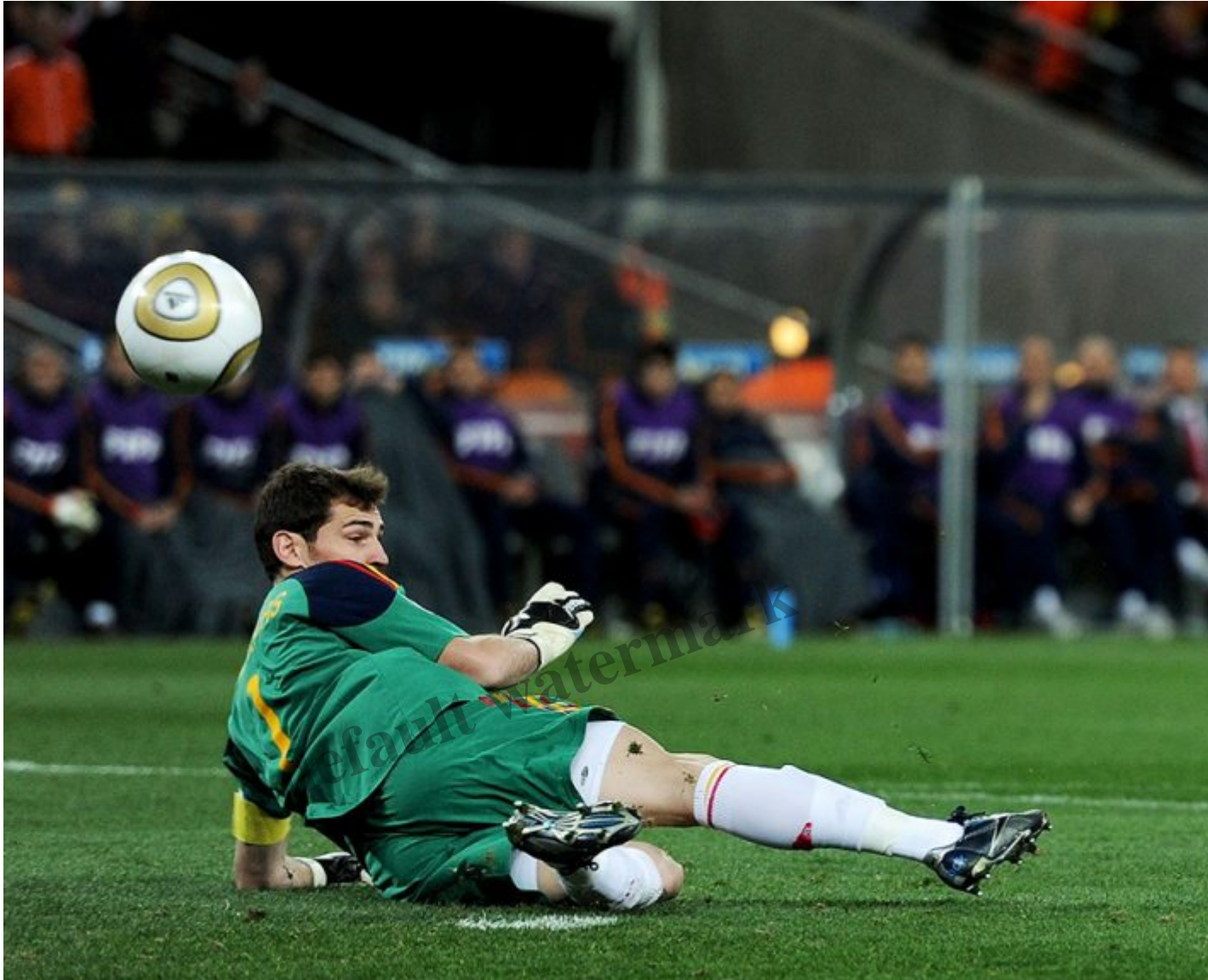
Robben's missed chance cost Netherlands the World cup

Back with Bayern, Robben was unfit to play for two months as his hamstring had not properly healed. Upon his new year return, the Dutchman took no time in getting back into the swing of things. In the fourteen games he played, Robben scored twelve goals and provided ten assists, but it wasn't enough to save Bayern in the league as they finished third and dropped out of Europe in the first knockout round.