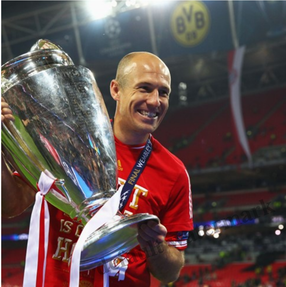
Robben finally got his hands on the Champions League trophy

Now under Pep, Robben returned to more frequent Bundesliga appearances in the 2013/2014 season in all but six as he scored eleven goals. Highlights for the winger include a clever chipped finish against Borussia Dortmund and a hat-trick against Schalke in a 5-1 win. These were his prime years in a Bayern team that looked to dominate European football.