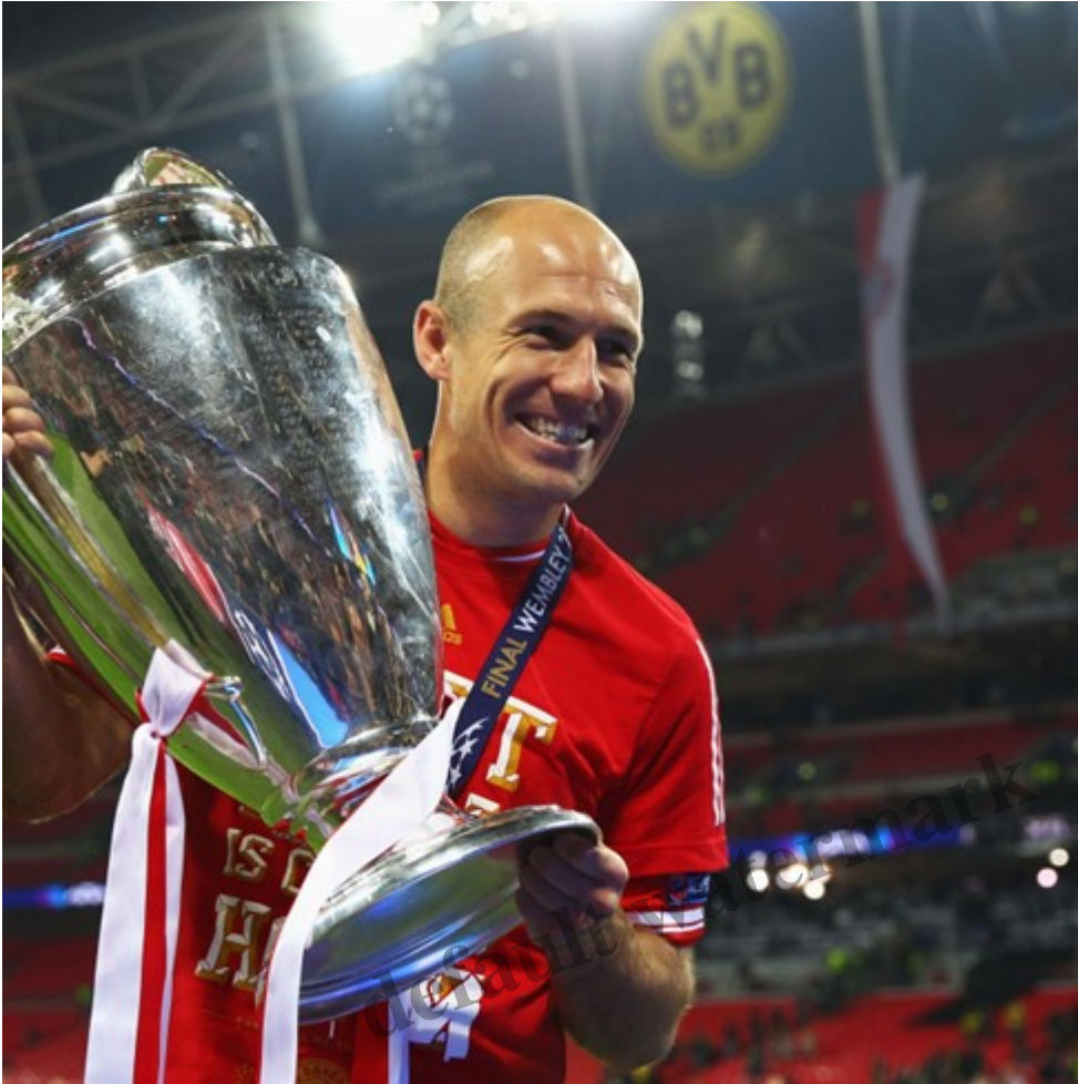
Robben finally got his hands on the Champions League trophy

Now under Pep, Robben returned to more frequent Bundesliga appearances in the 2013/2014 season in all but six as he scored eleven goals. Highlights for the winger include a clever chipped finish against Borussia Dortmund and a hat-trick against Schalke in a 5-1 win. These were his prime years in a Bayern team that looked to dominate European football.??