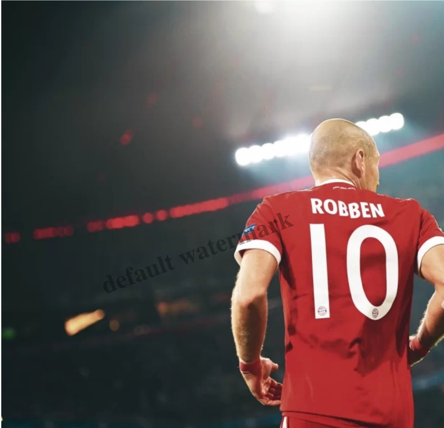
Robben made the Allianz Arena his home

Handed the No. 10 shirt, Robben made his debut in Bayern's opening league match. Feeling the instant love from Bayern fans, Robben had a fantastic game scoring a brace against Wolfsburg which kicked off his finest season yet. In a January four-game spell of back-to-back scoring, he struck an amazing freekick against Werder Bremen and bagged his second brace of the year in March against Freiburg in a 2-1 victory. Robben shared Bayern's desire to win their first UCL trophy since 2001 and in their round of 16 games against Manchester United and Fiorentina, Robben shone with a magnificent strike in Florence which put the Germans through on away-goals. In the next round, Bayern was trailing Manchester United. And desperately needing one more goal to advance, Robben struck an incredible first-time volley kick directly from a corner past Edwin Van der Sar in the 74th minute for