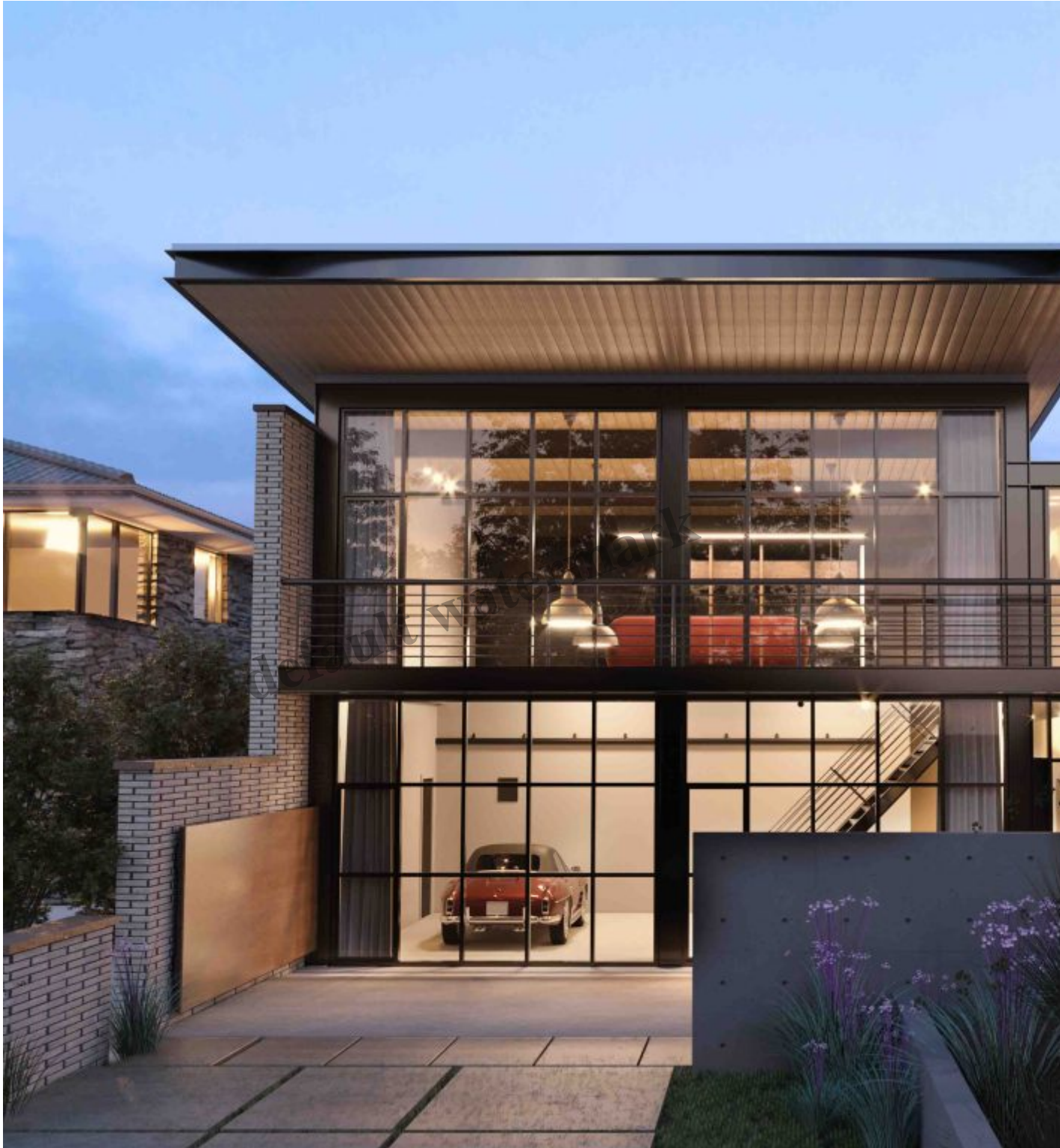
IB Residence Photorealistic concept 2018)

Looking back at Panache studio's success, Malamulo reminisced about the journey, which has been nothing short of adventurous. In 2013, Panache was crowned as the first winners of the Zambian Ecohome Green Design Competition. Design competitions are worth their weight in gold in the architecture industry. Exhibitions and competitions are the main avenue for growing your architectural